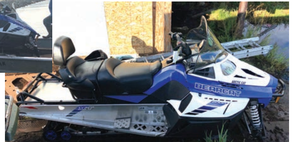
Ready for use in Selawik where average snowfall is over 60 inches