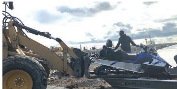
The donated snow machine is off-loaded in Selawik