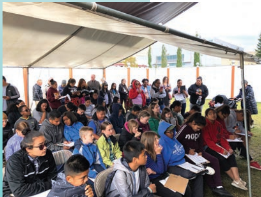
People across Anchorage visit Messiah's Mansion