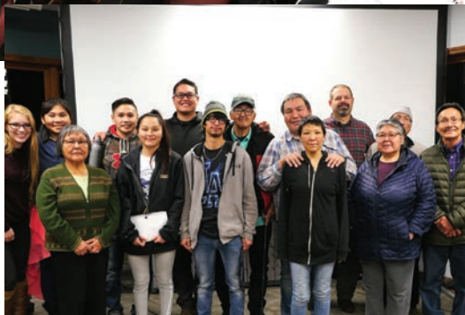
Alaska Native Leadership Workshop Attendees