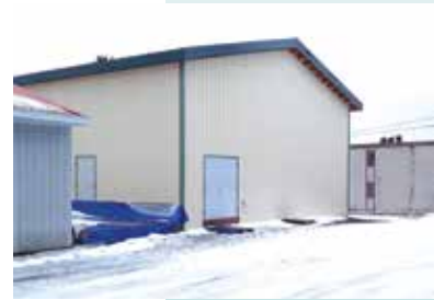
Dillingham School's New Gym