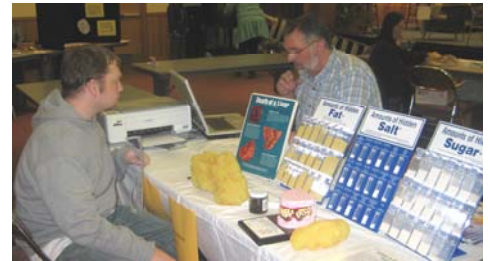
The Community Health Fair