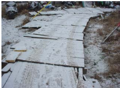
"New" Boardwalks made from discarded wood