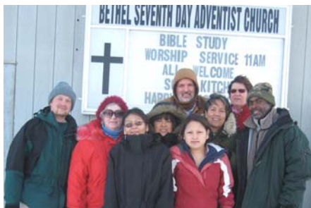
The Bethel Adventist Church at Work

barge, because you cannot drive to Bethel. Either way, shipping is very expensive; as an example it cost us approximately $2,300.00 to ship our Dodge van from Anchorage to Bethel on the barge. We sold or gave away most of our furniture that we determined we could live without and drastically downsized our 25 year accumulation. Our Dodge van was shipped fully loaded, along with a lift van, which is a wooden crate 48" wide x 84" long x 84" high on the barge. Since the barge would take 2-3 weeks to arrive in Bethel (depending on the weather), we also shipped 12 boxes via air freight full of essential items such as bedding, clothes, a few pots and pans for cooking and my computer which is used for my part time consulting business.