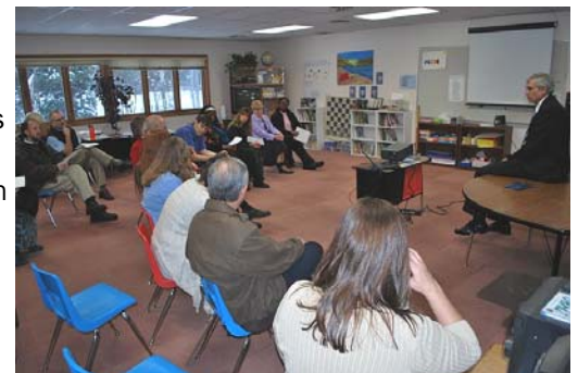
Home Schooling Session