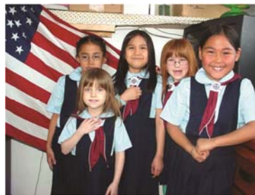
Newly Inducted Adventurers

I believe we had 15 kids in our house this day, packed into our 10 x10 living room. We decided we needed a more structured way to share Jesus with the kids, and something we could do on days other than Sabbath.