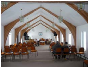
Gambell Church Interior

President Roosevelt established a reindeer reservation in Gambell in 1903. A reindeer camp was established at the village site of Savoonga and by 1917 the herd had grown to over 10,000 animals. Savoonga is known as the "Walrus Capitol of the World." Walrus, whale, seal, and reindeer comprise 80 percent of the islanders' diets. Over 96 percent of the population of St. Lawrence