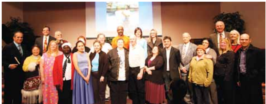
New members of the Hillside-O'Malley Church Family

The board members of the Hillside-O'Malley Church were so thankful they listened to the prompting of the Holy Spirit to reach out to the community through evangelism. Not only did the church experience a rich harvest in souls, but a spiritual revival spread throughout the church family and financial troubles disappeared. This gives me a new understanding of what Jesus said in John 4:35, " Do you not say, there are still four months and then comes the harvest? Behold, I say to you lift up your eyes and look at the fields, for they are already white for harvest "